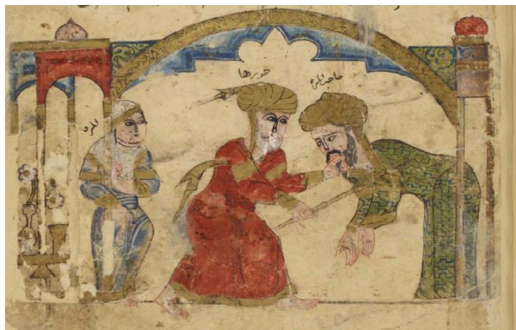
PL.2. The husband beats the lover in the presence of his wife, Syria,1200-1220A.D./597-617A.H.Pairs, Bibliotheque Nationale de France, Ms.arabe 3465,fol.39v(28x20,5cm)(After the Manuscript of Kālilā and Dimnā in Bibliotheque Nationale de France.