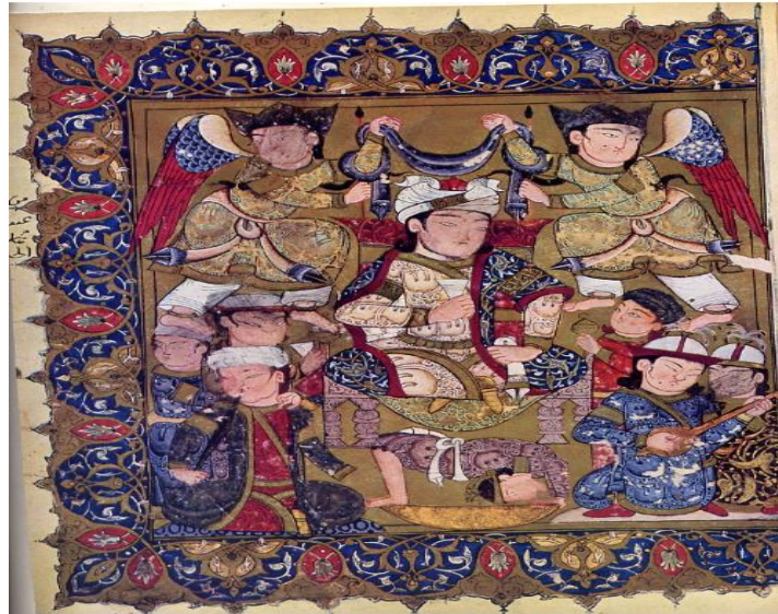
Pl.3 A prince sitting on his throne surrounded by his followers, manuscript of Maqamat āl-ḥāriri, 734 A.H./1334 A.D., (8 th A.H./14 th Century A.D.), National Library in Vienna, (A.F.9, fol.1r ms.).