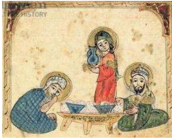
PL.7.A scene represents a young girl as a servant bringing food to Abu Zāyed and al Harith (The 15 th Maqamah),Mousl,Iraq,1256a.d./645a.h.(13 th century A.D./7 th century A.H.),London,Britich Library,Ms.Or.1200 fol.40v(page size 24.5x17cm,with restoration,Originally 24,5x15,5cm)(After Grabar(o).the illustrations of the Maqamat Chicago:press,1984,pp.13,52,53,54)