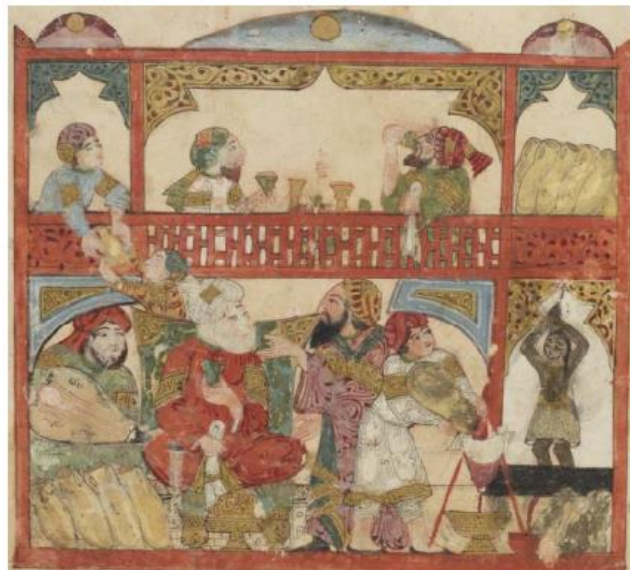
Pl.4. Abu Zāyed and al-ḥairth during a meeting of glee inside a tavern in the presence of men and a dancer girl (The 12 th Maqamah), 1237 A.D./634 A.H., (13 th Century A.D./ 7 th A.H.), copied and illustrated by al-Wasiti, Paris, Bibliotheque Nationale de France, Ms. arabe 5847, fol. 13v (37x28cm) (After the Manuscript of Maqamat of āl-ḥāriri in , Bibliotheque Nationale de France.