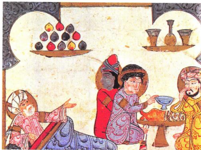
PL.6 A scene represents a doctor who wakes up to find a feast inside his house, Da'wat al Atibba or Banquet of The Physicians, 4 th December 1272 A.D. / 10th Jumada al-Awwal 671 A.H., Mamluk Period, Milan, Italy, Biblioteca Ambrosiana, Ms. A. 125 inf.