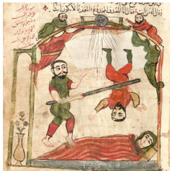
PL.10. Three thieves entering on a man and his wife in their private room, Date is Munich, German, Bavarian State unknown, Library, Cod. Arab. 615, fol. 29v (28x18.5cm) (After the Manuscript of Kāilā and Dimnā in Bavarian State Library, Munich, German).