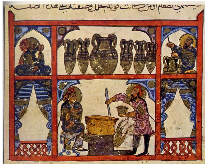
Pl.9 A man helps a pharmacist during preparing the medicine, Baghdad, Iraq, 1224 A.D./621 A.H., (13 th Century/7 th A.H.), New York, Metropolitan, Museum of Art, W.675, page size 33,5x24.9cm. Manuscript of Dioscorides Materia Medica.