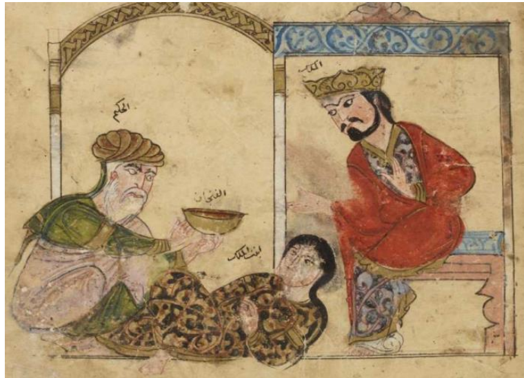
PL. 5. A scene shows a king and his daughter in the presence of a physician, Syria, 1200-1220 A.D./597-617 A.H. Pairs, Bibliothèque Nationale de France, Ms. arabe 3465, fol. 78v (28x20,5cm) (After the Manuscript of Kālilā and Dimnā in Bibliothèque Nationale de France).